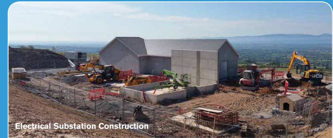
Electrical Substation Construction