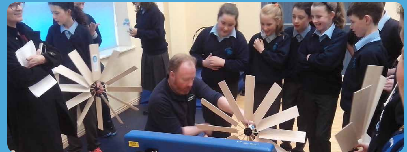
↑ We held a workshop in Anacarty National School where students had the opportunity to learn about the benefits of renewable energy and even got the chance to build their own wind turbines.