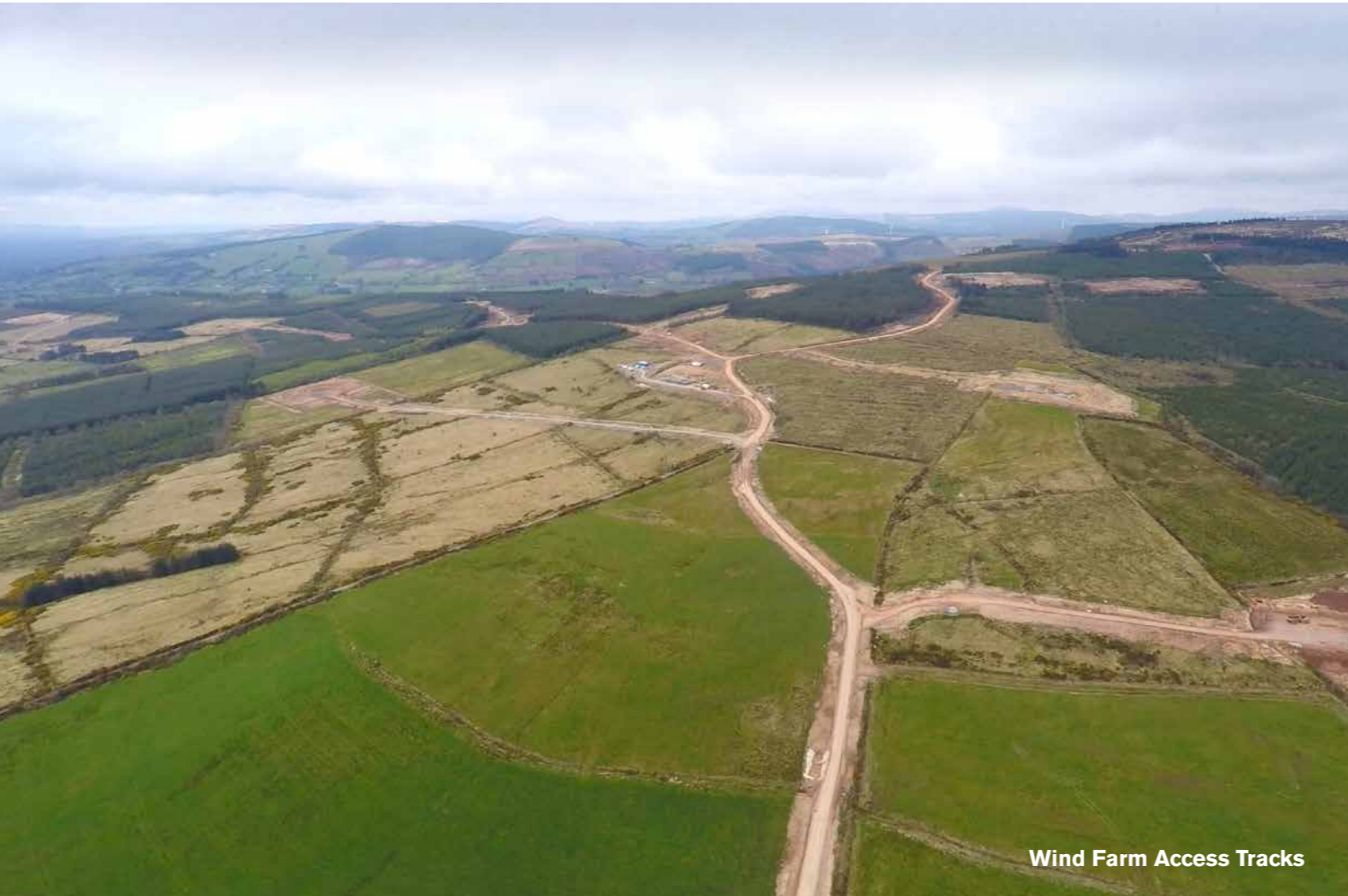
Wind Farm Access Tracks