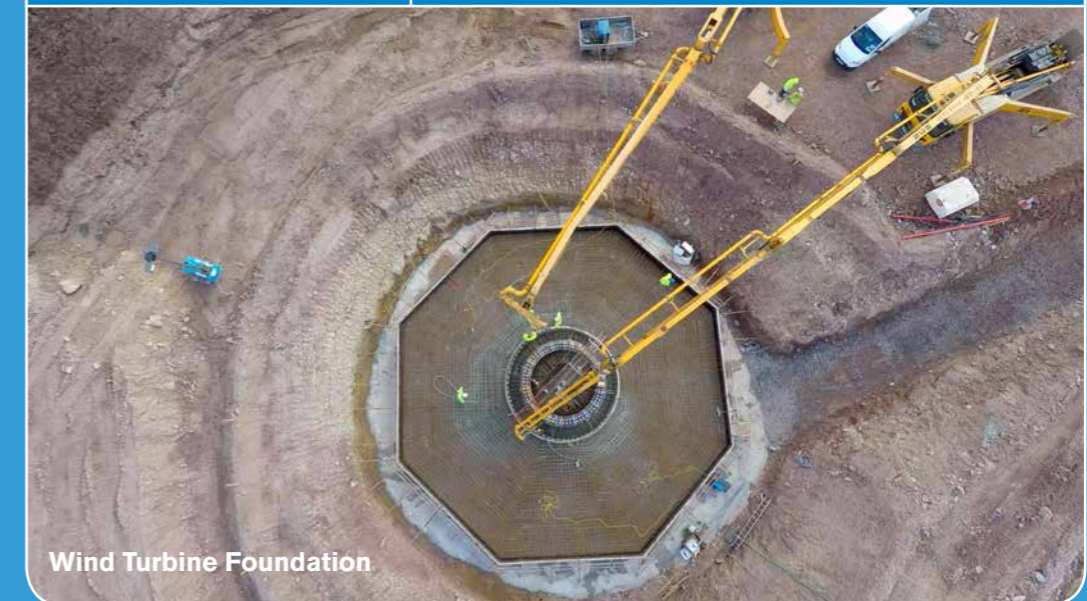
Wind Turbine Foundation