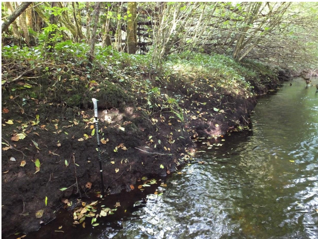
Site Photo 5: Steep (close to vertical) banks along dominant Toon channel