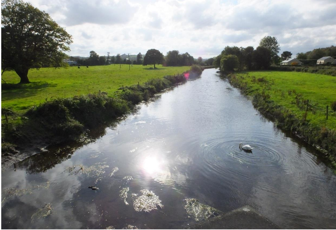
Site Photo 1: Toon River upstream of Toon Bridge