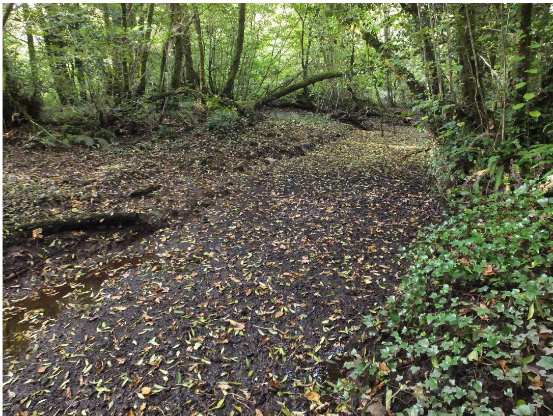
Site Photo 3: Dry anastomosed channel (note trapezoidal cross-section)