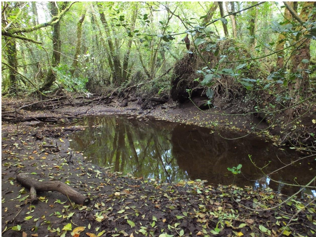
Site Photo 6: Silty hollow arising following tree fall