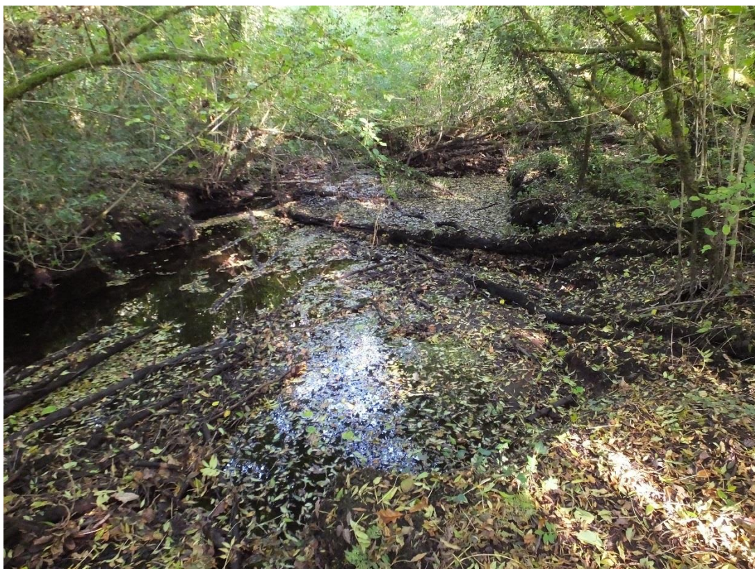
Site Photo 4: Debris dams within Gearagh woodland